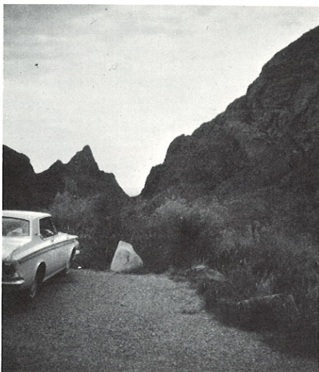
"The Window" Big Bend